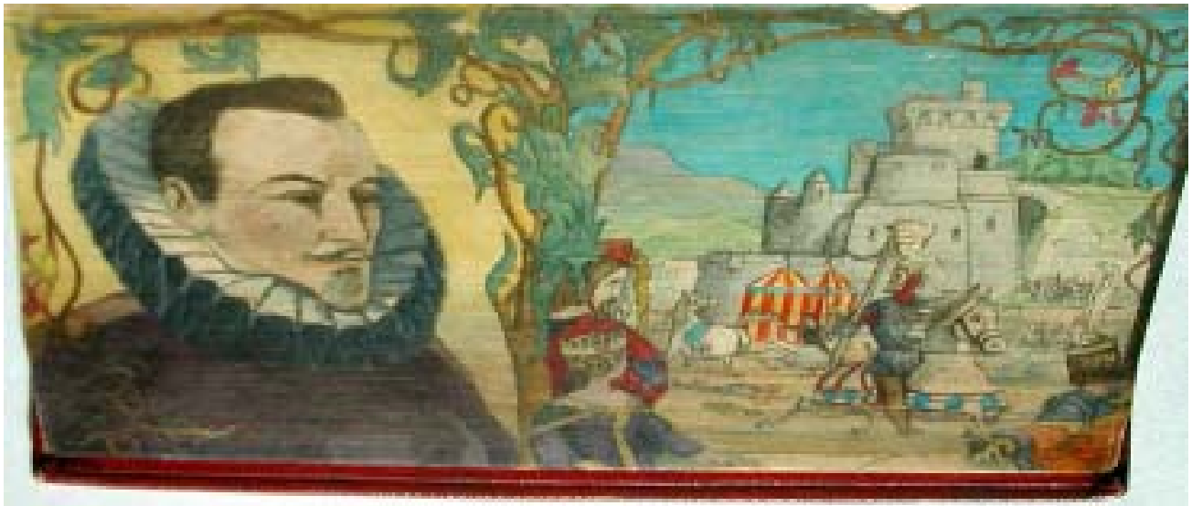
Actual Fore-edge Painting (below)