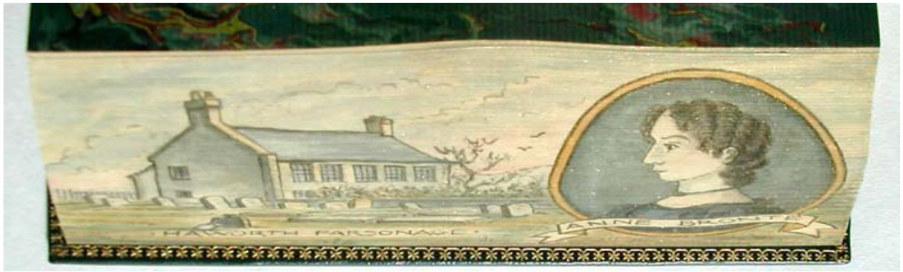
Item 5 Tenant of Wildfell Hall